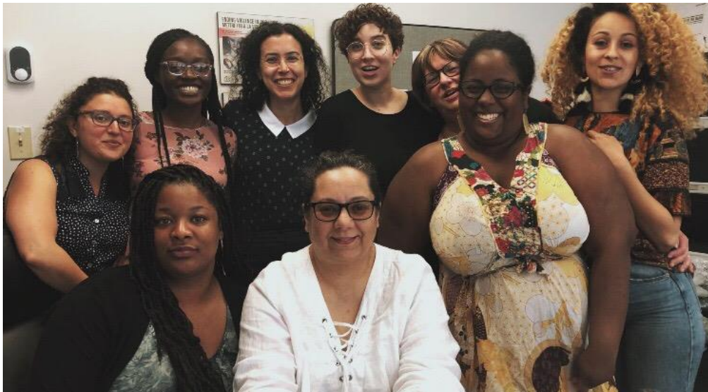
Figure 6 DAWN Team, June 2018