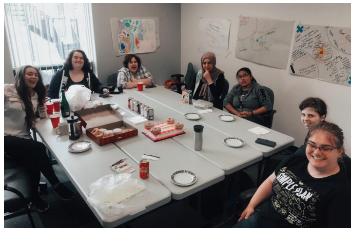
Figure 1 YTF cohort celebrates their final day

As part of our partnership with the Canadian Council on Rehabilitation and Work (CCRW), we are hosting a " Youth the Future " job placement programs for women only at our head office. This ground-breaking pilot has been specifically designed to support young women and girls with disabilities aged 15 – 30. Through this pilot DAWN Canada and CCRW are seeking to better understand the wrap around services needed to improve the rate of unemployment for this group.